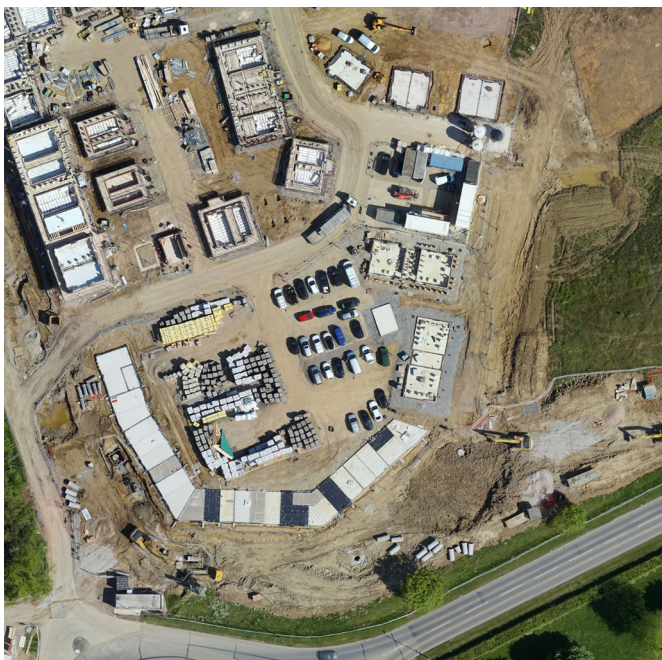
UAV Survey of housing development